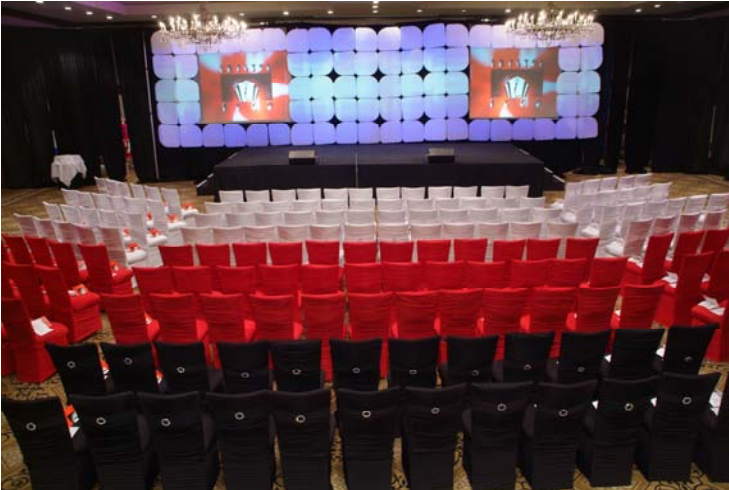
Stage Décor Tiles – Moss; Chairs – Ducky Bob's; Staging and Pipe and Drape – Fashionable Events; Screens – Stage Directions; Lighting and Sound - LD Systems

Omni Houston Hotel, which hosted over three hundred special events industry professionals and guests. The guests were in awe of the remarkable concept tables, lavish food stations and trendsetting entertainment.