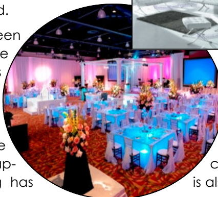
Innovative décor: lighted tables and lounge furnishings (inset) elevate events.

The DECORATIONS used at events are more over the top than ever. With the invention of many new and exciting products, the use of décor can change a plain boring ballroom into a fairytale setting or crisp clean corporate environment. Lighted tables, lounge furniture and inventive centerpieces are just a few of the new décor trends. The use of other non-conventional items, such as ice sculptures is also playing a big role in the event's atmosphere.